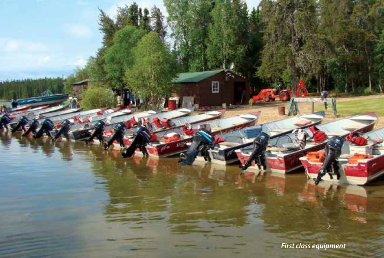
First class equipment