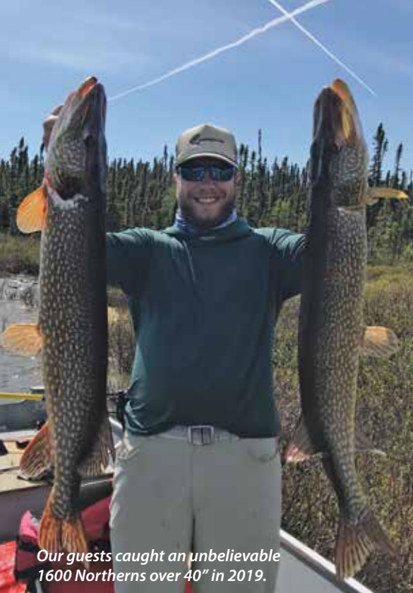
Our guests caught an unbelievable 1600 Northerns over 40" in 2019.