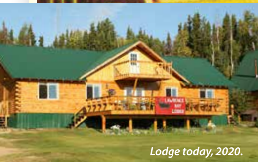
Lodge today, 2020.