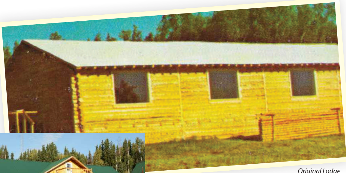
Original Lodge built in 1971.