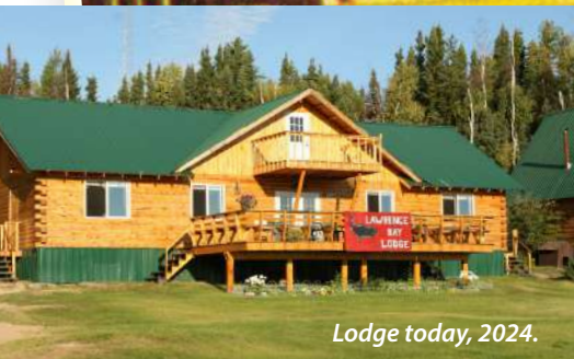
Lodge today, 2024.