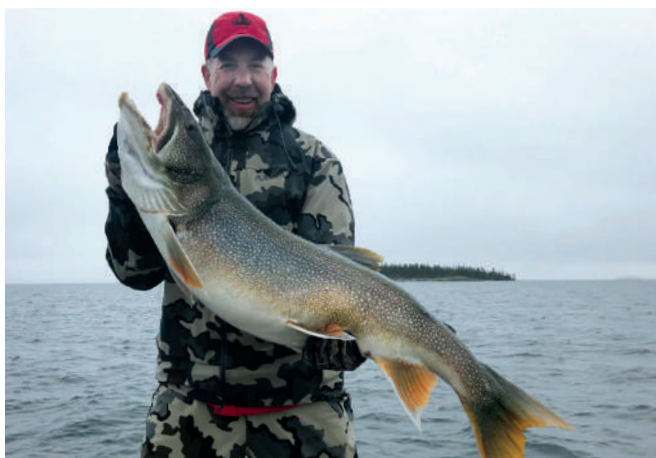
Our guests caught an unbelievable 1600 Northerns over 40" in 2023.