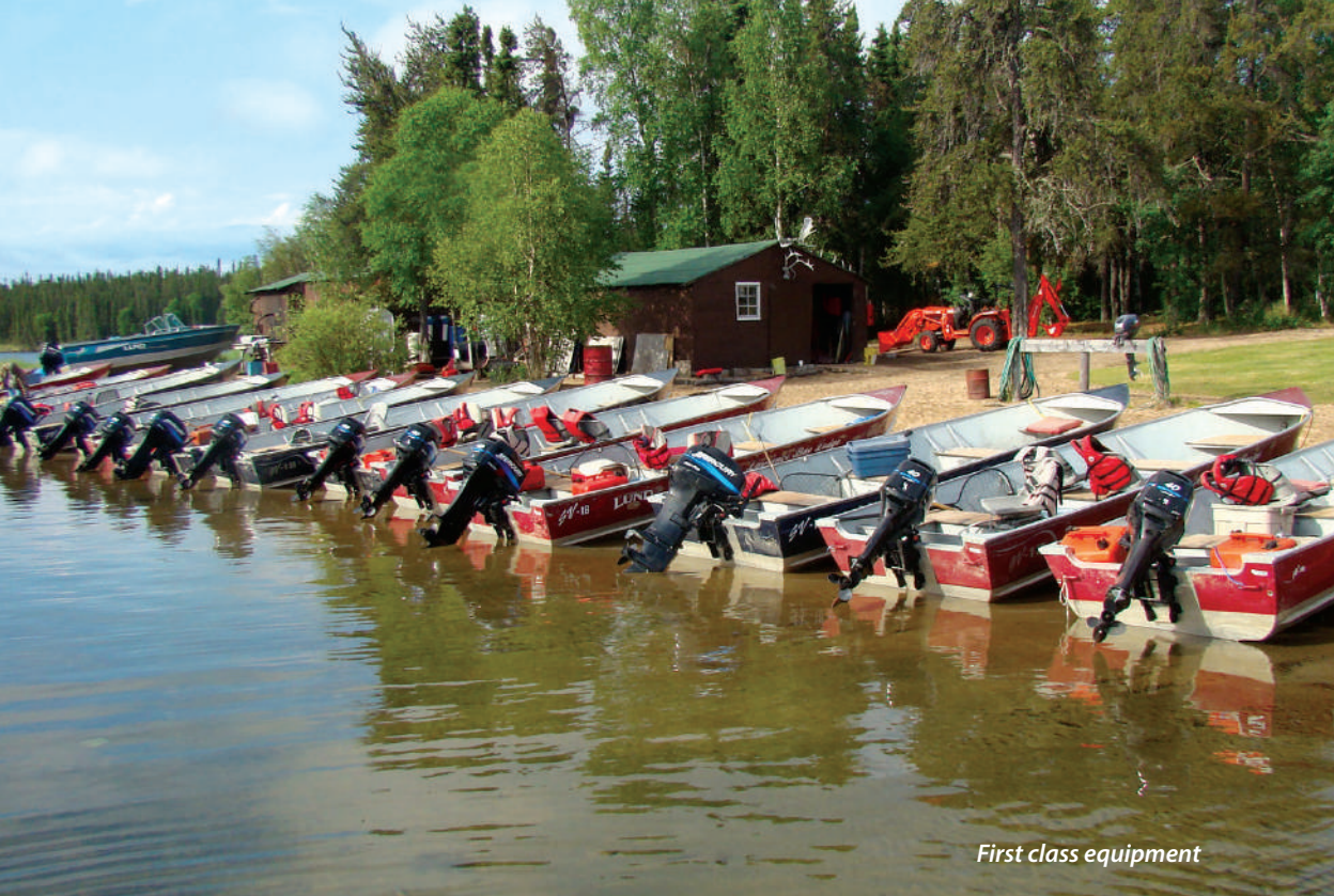
First class equipment